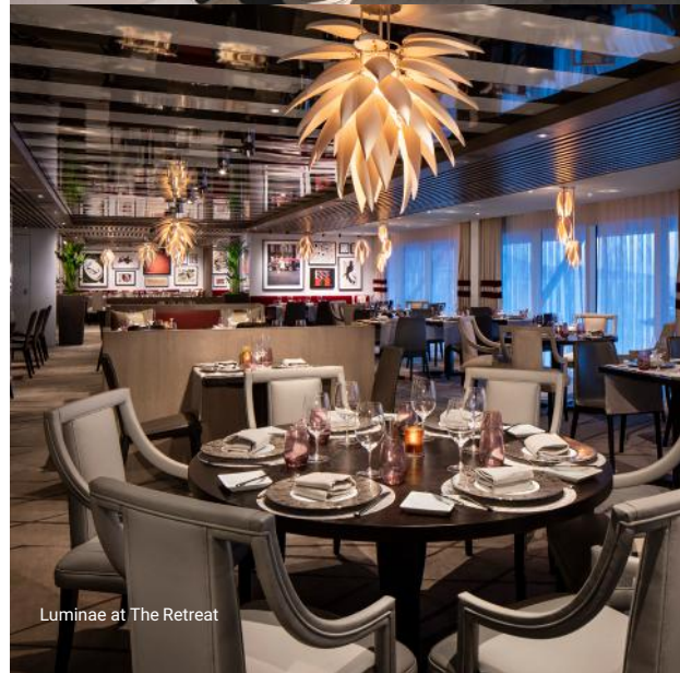
Luminae at The Retreat