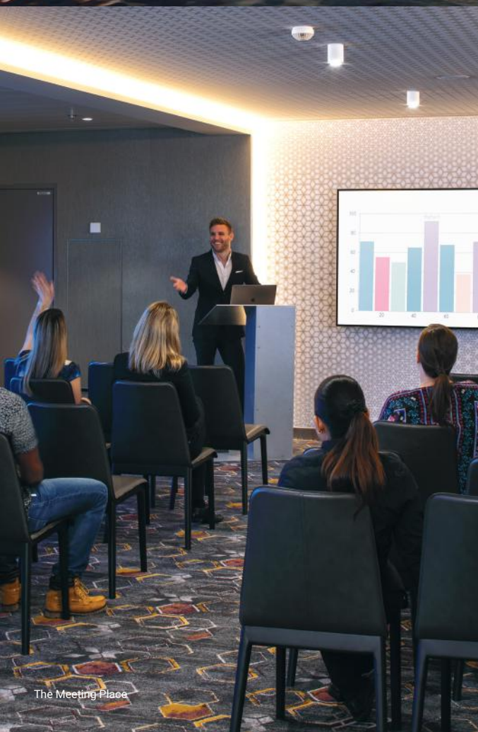
The Meeting Place