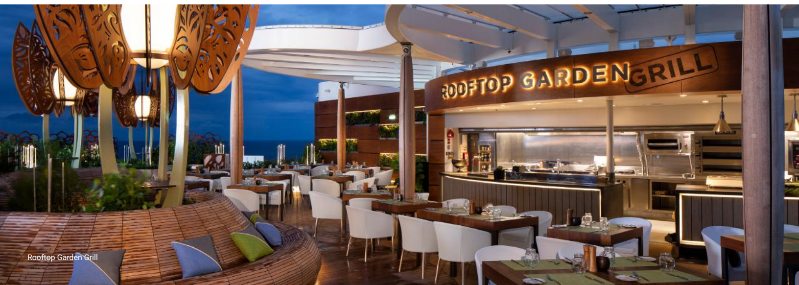
Rooftop Garden Grill