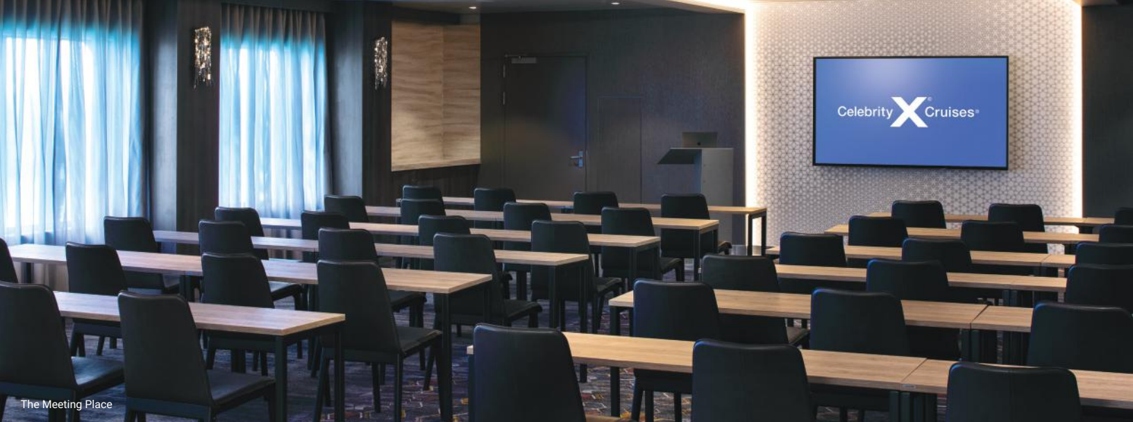
The Meeting Place