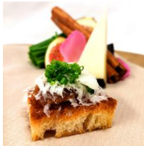
FIG AND MANCHEGO "BRUSCHETTA"

Figs, port, balsamic, star anise, cinnamon, micro basil